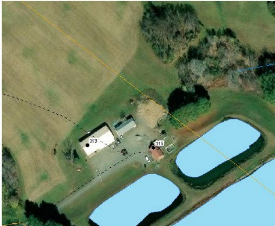
Stanardsville Wastewater Treatment Plant