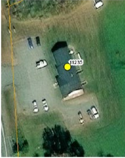
Water and Sewer and Extension offices