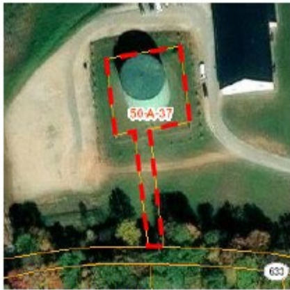
Amicus Road Tank