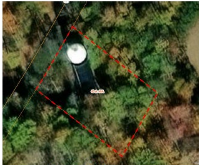
Gilbert Road Tank