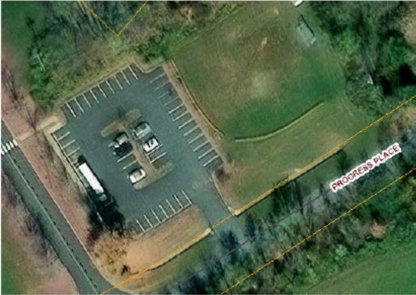
Tball Field and parking lot