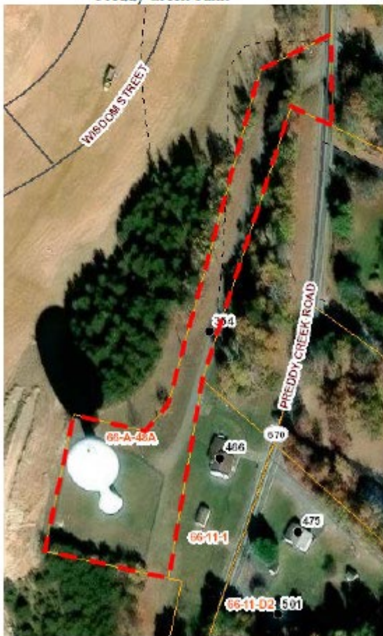
Preddy Creek Tank