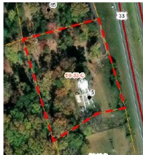
Rte 33 Tank