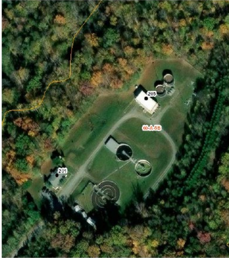
Ruckersville Wastewater Treatment Plant