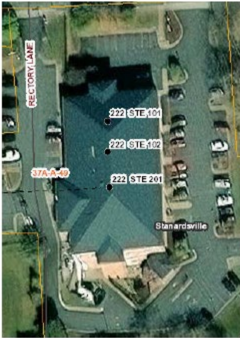
PVCC/Library/Senior Center and back parking lot